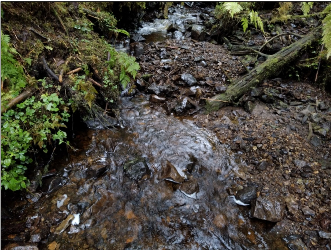
Figure 2.—Channel at waypoint 857.