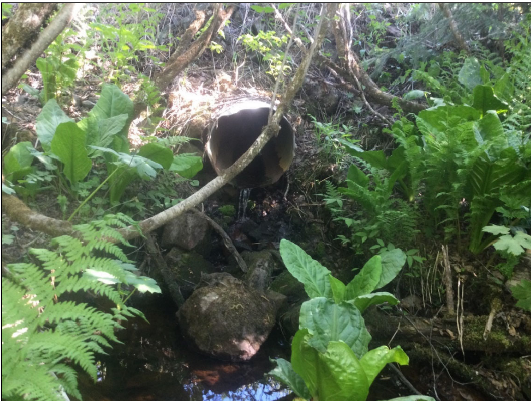
Figure 4.—Perched culvert outlet at waypoint 405.