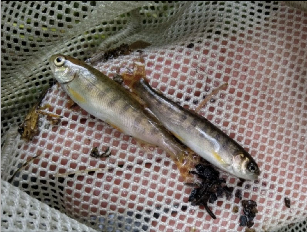
Figure 1.—Juvenile coho salmon captured at waypoint 855.