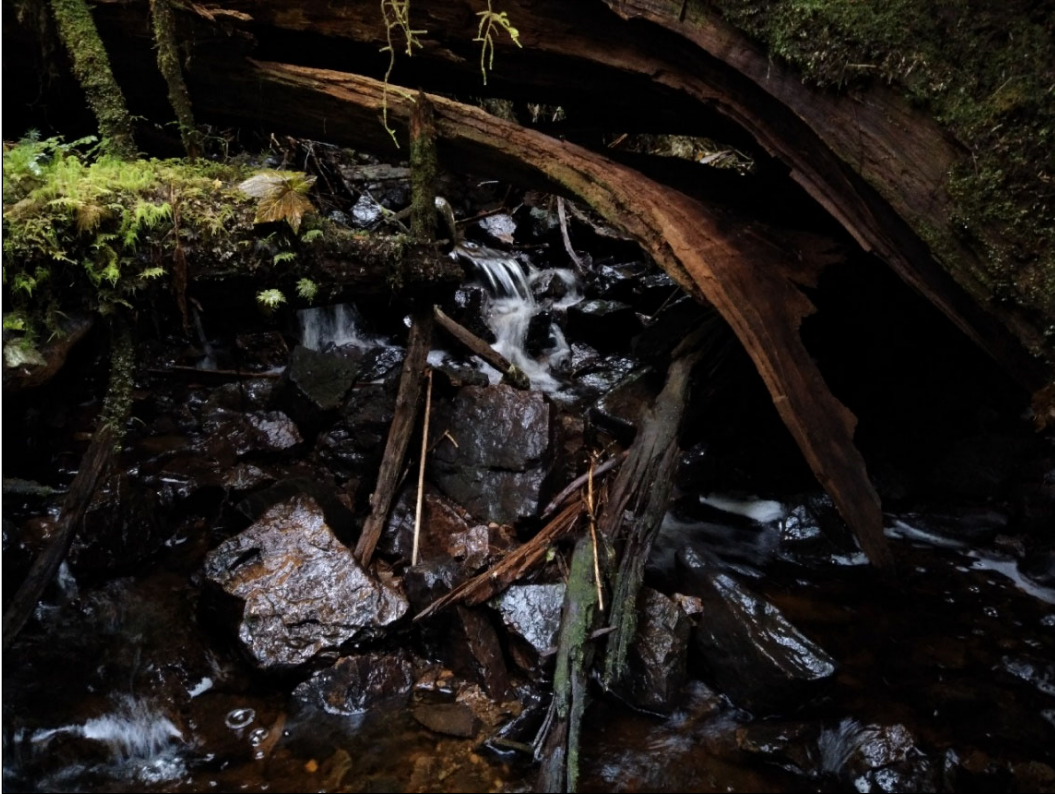
Figure 3.—Juvenile coho salmon captured at waypoint 858.